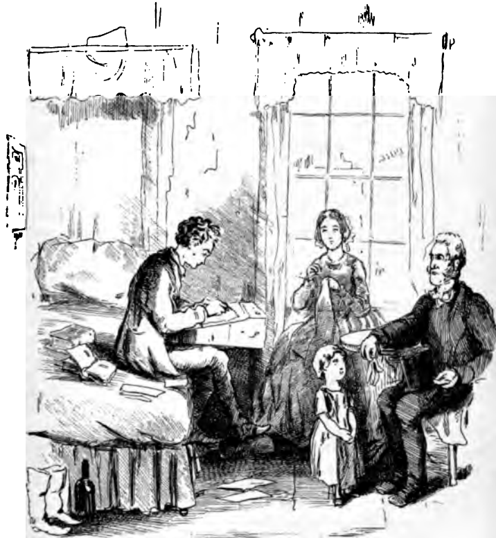
THE PALL MALL GAZETTE